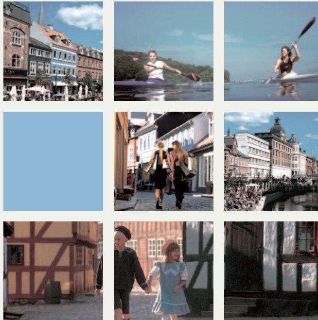
design-> b3.deuden.de Rostock, Germany